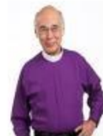
Roman Purple Bishops