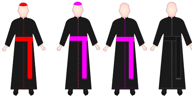
Presiding Bishop Bishop Overseer Pastor/Elder

The Cassock , an item of Christian clerical clothing , is an ankle-length robe . The Cassock is generally close-fitting. It may be worn by all clergy as a symbol of the servant. The bishops wear this garment in deference to our Lord Jesus who instructed, “they who would be chief among you, shall be servant of all.